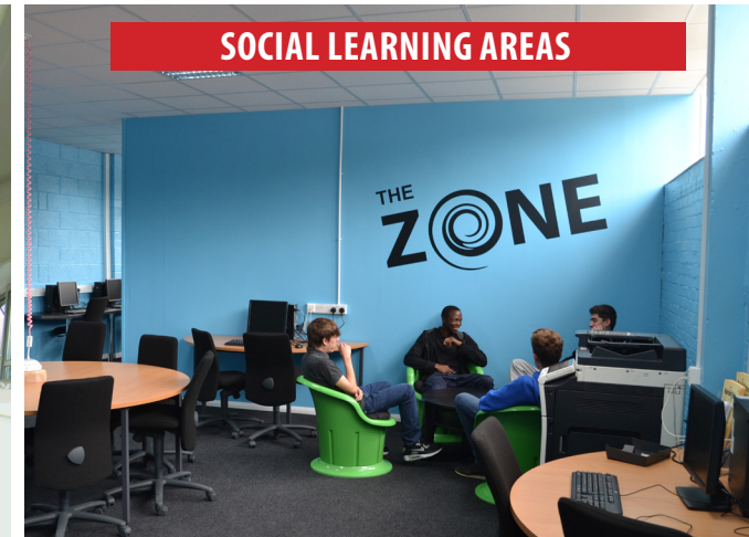
SOCIAL LEARNING AREAS