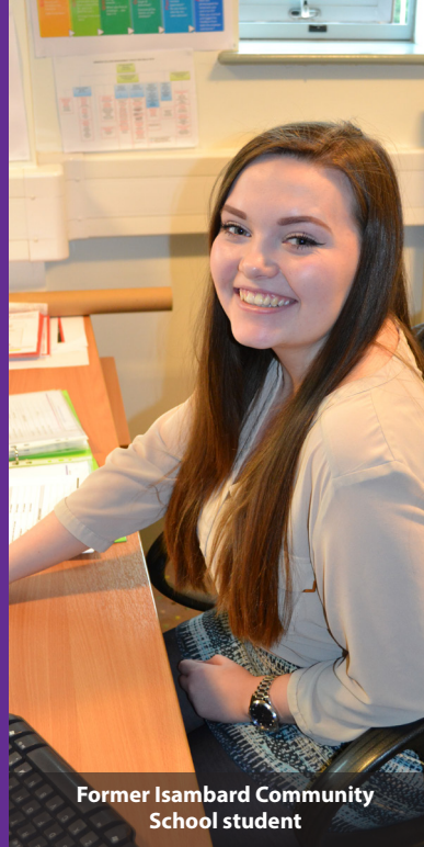
Former Isambard Community School student