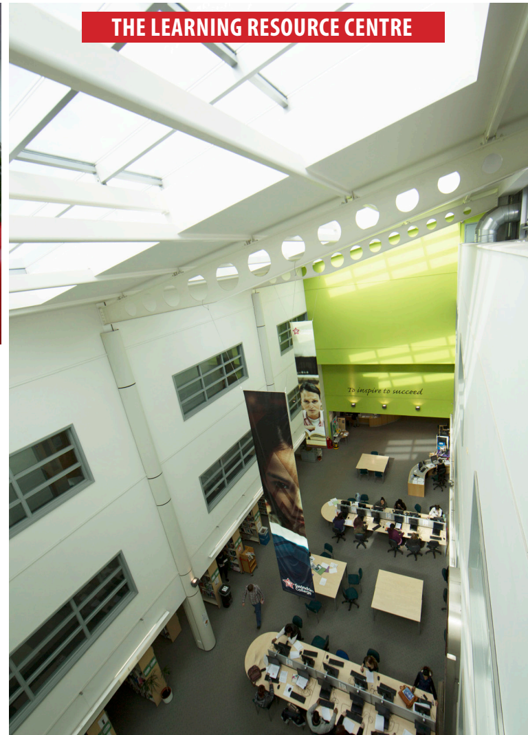
THE LEARNING RESOURCE CENTRE