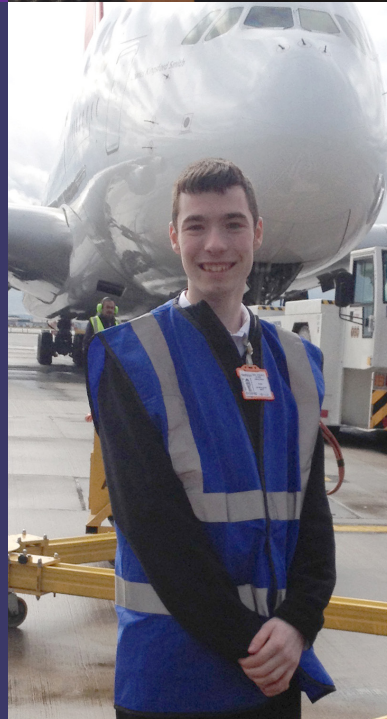
Former Lydiard Park Academy student