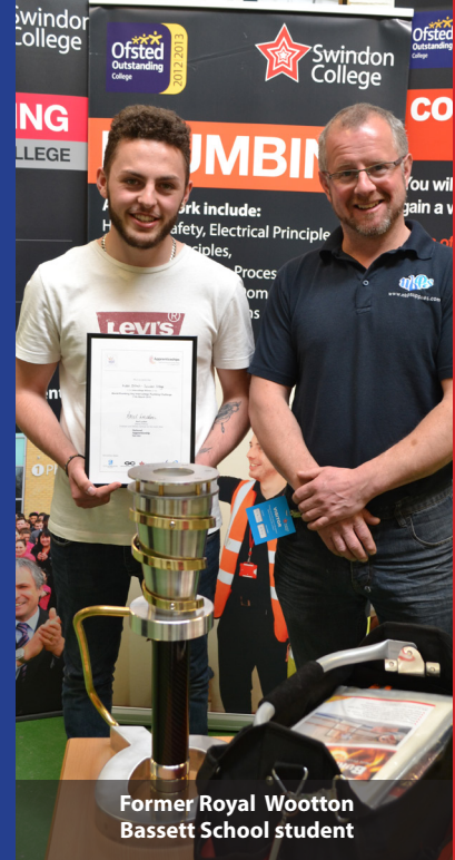
Former Royal Wootton Bassett School student