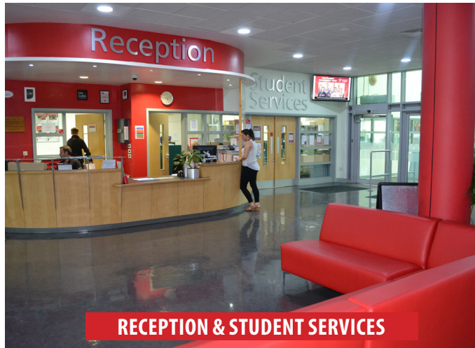
RECEPTION & STUDENT SERVICES

Our campus at North Star has industry-standard facilities for Hair, Beauty, Engineering, Construction, Catering and Hospitality, Computing, Art and Design and Motor Mechanics. You really will get the full work experience!