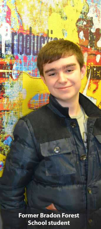
Former Bradon Forest School student

"I chose to come to Swindon College as it just felt right. The course was exactly what I wanted and from speaking to the tutors I knew I would feel comfortable studying here. The tutors are very helpful and they have a passion for Media Production which is infectious, it makes me work harder".