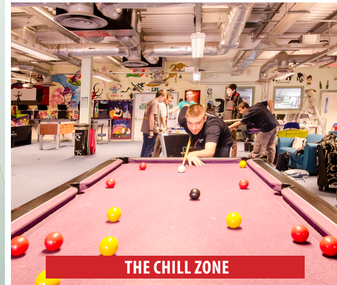
THE CHILL ZONE

It's easy to apply online. Visit www.swindon.ac.uk